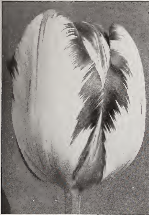
Rose Bybloem Tulip, Athalia